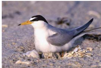
Least tern

Before you leave, take a moment to look around and take everything you brought with you. This ensures a pleasant experience for the next visitor, which may be you.