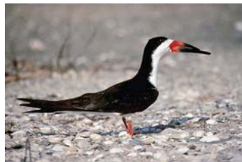
Black skimmer

Help us maintain the valuable amenities of the Preserve as you enjoy the beaches, fish the shallows, and watch the birds.