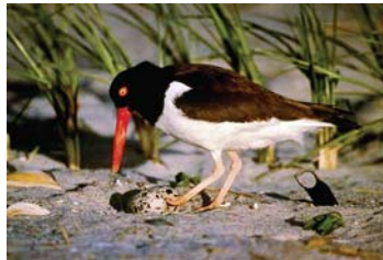
American oystercatcher

Thousands of protected migrating and wintering shore and sea birds use the Preserve during the fall, winter and spring months. Nesting species that enjoy special protection by the State include the American oystercatcher, least tern and black skimmer. All bird species benefit when humans do not disturb them. Please remember that we are visitors to an area they call home.